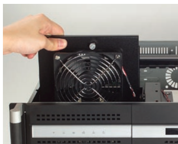
Easy-to-maintain system fan