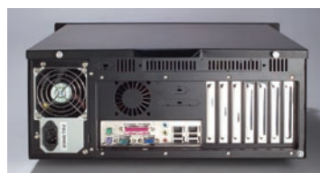
Rear view of ACP-4362MB