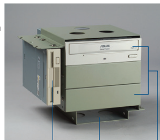
One 3.5" drive bay Three 5.25" drive bays One internal 3.5" drive bay space