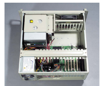
Motherboard can fit in 450 mm (17.7") depth