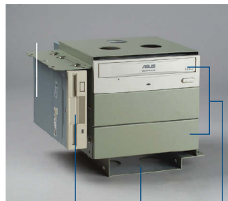
One 3.5" drive bay Three 5.25" drive bays One internal 3.5" drive bay space