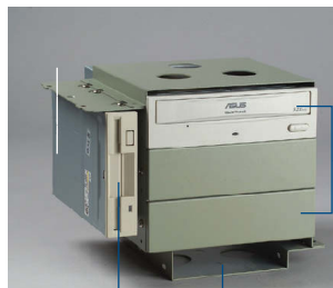
One 3.5" drive bay Three 5.25" drive bays One internal 3.5" drive bay space

Easy-to-maintain cooling fan System reset switch