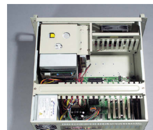
Motherboard can fit in 450 mm (17.7") depth