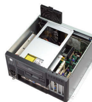
Easy-to-maintain fan filter