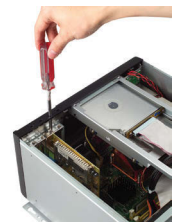
User-friendly mechanical design for installing an add-on card