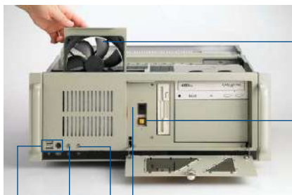
HDD LED Power switch USB & PS/2 Power LED