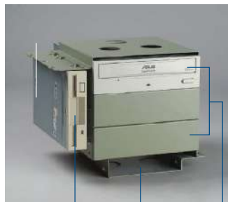
One 3.5" drive bay Three 5.25" drive bays One internal 3.5" drive bay space