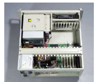
Motherboard can fit in 450 mm (17.7") depth