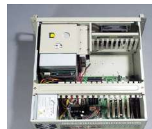
Motherboard can fit in 450 mm (17.7") depth