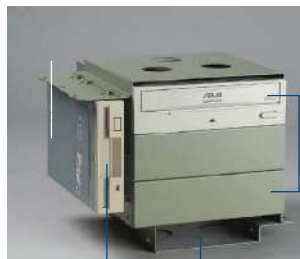
One 3.5" drive bay Three 5.25" drive bays One internal 3.5" drive bay space